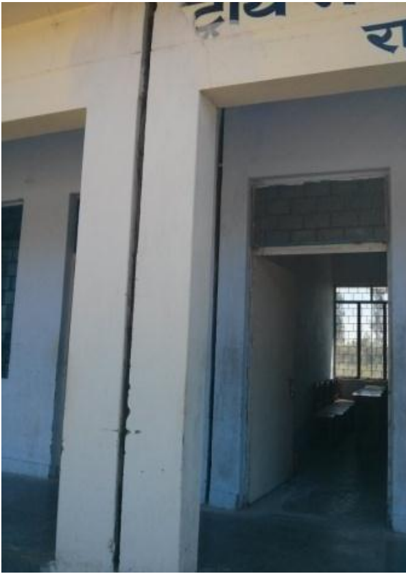
Review 3: IMG_20140314_102455.jpg