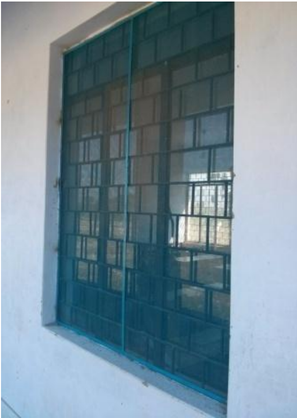
Review 3: IMG_20140314_101447.jpg