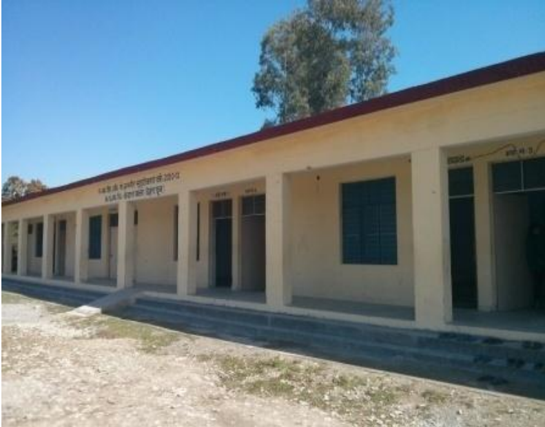
Review 2: IMG_20140314_111156.jpg