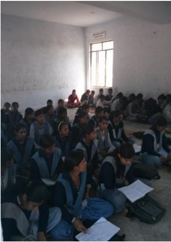
Review 3: IMG_20140314_101407.jpg