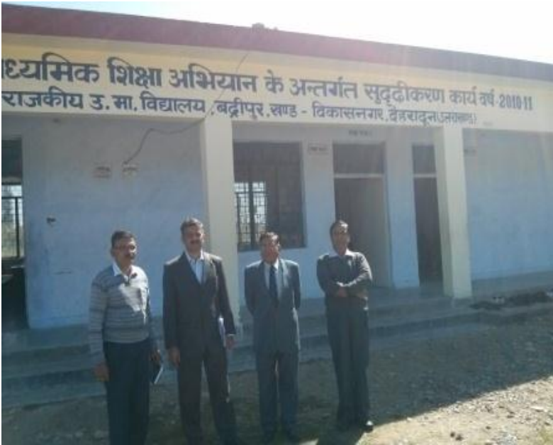
Review 3: IMG_20140314_102721.jpg