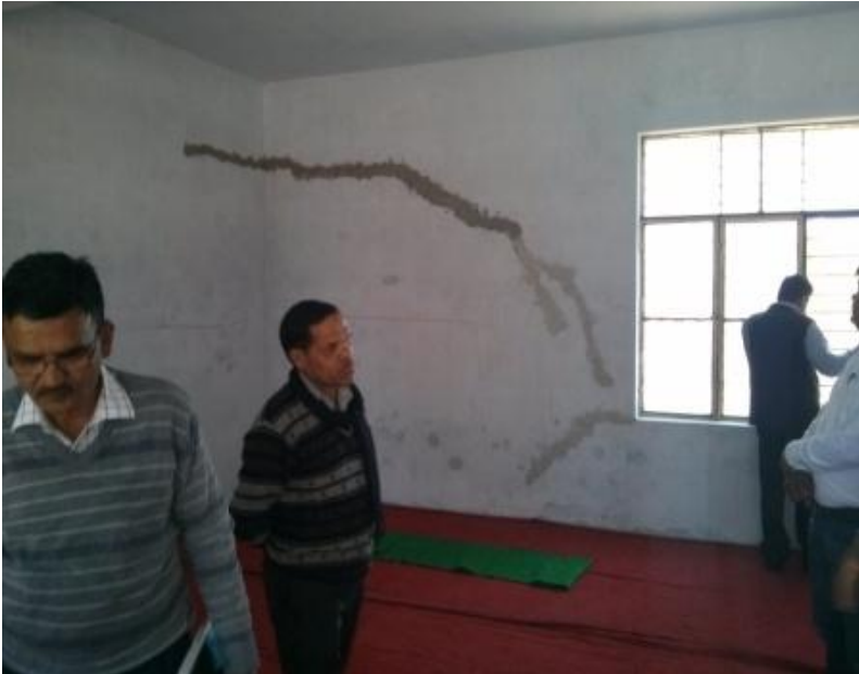
Review 2: IMG_20140314_111844.jpg