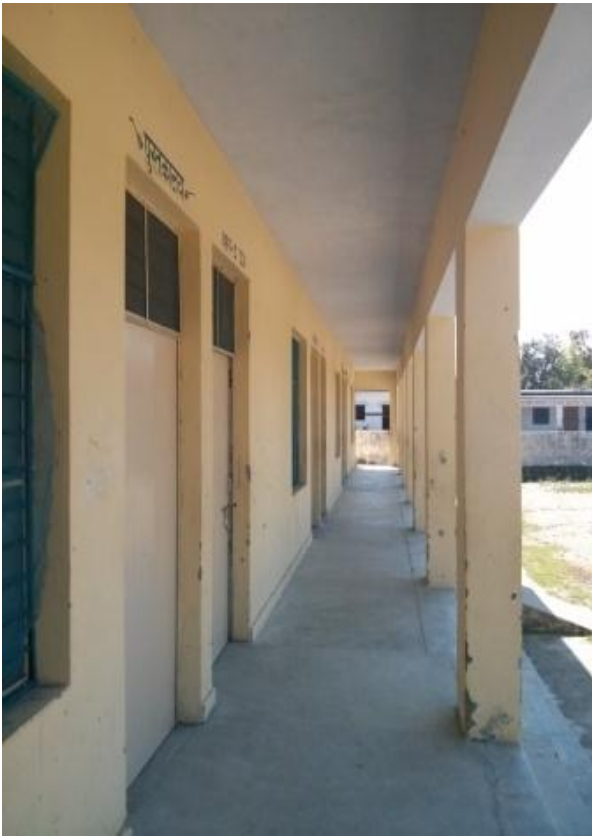
Review 2: IMG_20140314_111929.jpg