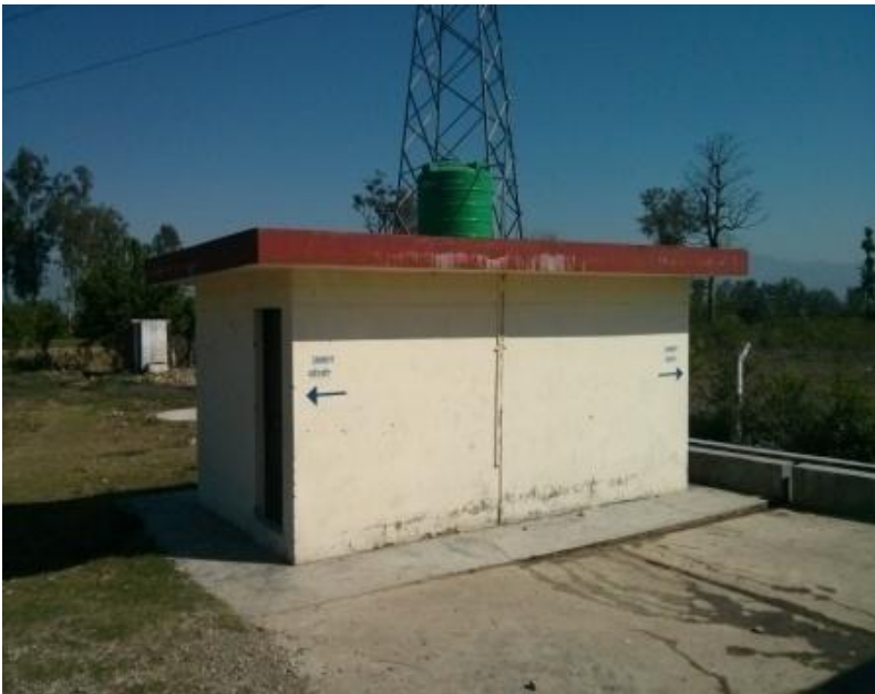
Review 3: IMG_20140314_101726.jpg