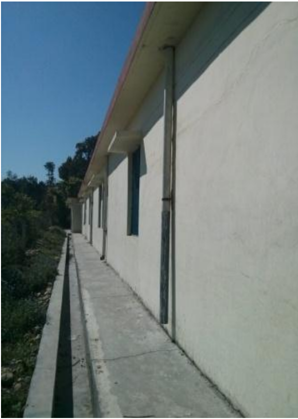
Review 3: IMG_20140314_101702.jpg