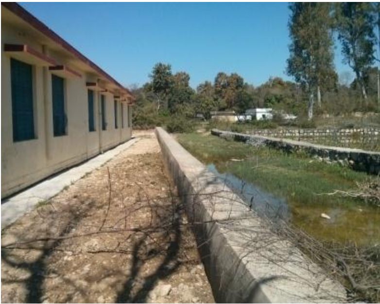
Review 2: IMG_20140314_112916.jpg