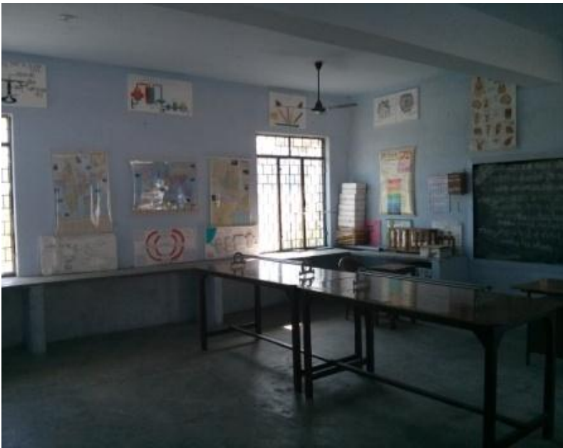
Review 3: IMG_20140314_101215.jpg