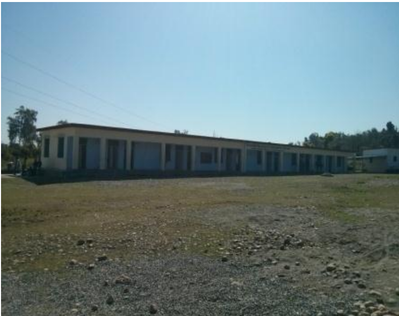
Review 3: IMG_20140314_100710.jpg