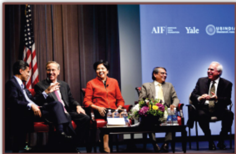
Shri Kapil Sibal (sitting extreme right) at a panel discussion with (from left to right): Newsweek International Editor, Mr. Fareed Rafiq Zakaria, the Yale University President, Mr. Richard C. Levin, the PepsiCo CEO, Ms. Indra Nooyi and the Yale University Professor Shri Rakesh Mohan, in New York on September 21, 2010.

The discussion was held at the Citibank headquarters in New York and it was attended, among others, by President of Yale Mr. Richard Levin and PepsiCo CEO Ms. Indra Nooyi. The moderator for the discussion was well-known journalist Fareed Zakaria.