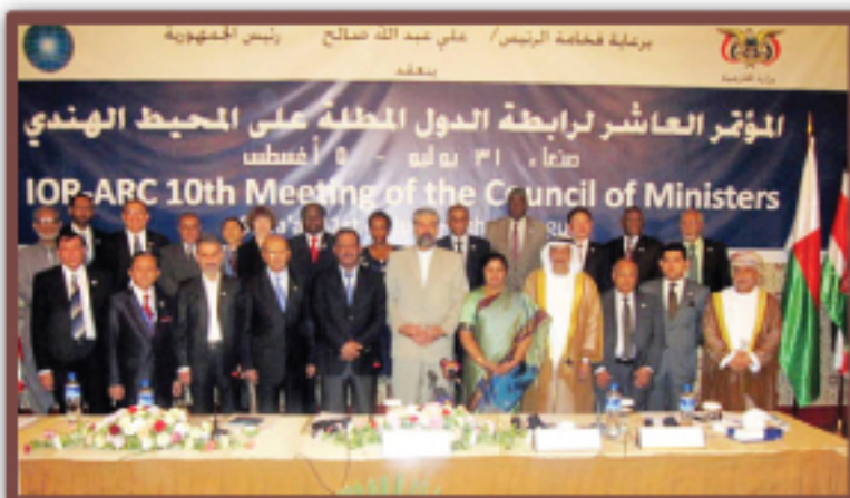
Smt. D. Purandeswari at the Council of Ministers Conference of the IOR-ARC (Indian Ocean Rim- Association for Regional Cooperation), at Sana'a in Republic of Yemen on August 05, 2010.

Smt Purandeswari informed the Conference that the Indian Government was committed to strengthen the activities of the IOR-ARC and invited the participating