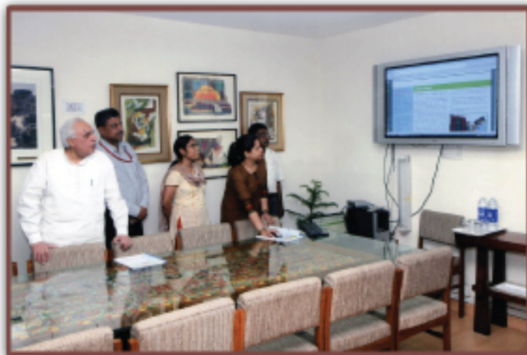
Shri Sibal releasing the Newsletter On Higher Education on September 09, 2010.

The monetary support to CWG medalists will comprise of the tuition fee as well as the maintenance expenditures.