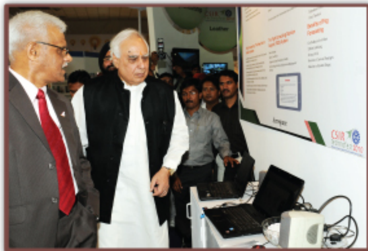
Shri Sibal going round at the 'Technofest' 2010 – Showcasing industry-CSIR linkages, in New Delhi on November 14, 2010.

The first-ever CSIR Technofest-2010 was inaugurated by Shri Kapil Sibal on November 14, 2010, as a part of the India International Trade Fair (IITF). CSIR is the Council for Scientific and Industrial Research and the CSIR Technofest-2010 is aimed at showcasing the organization's expertise in the fields of Science & Technology with the help of 15 theme pavilions.