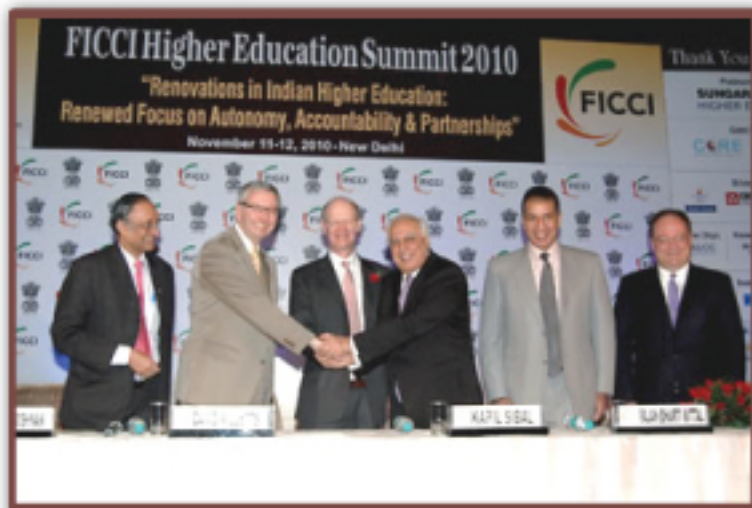
Shri Kapil Sibal (fourth from left) at the FICCI Higher Education Summit 2010 along with others present.

Shri Kapil Sibal inaugurated the FICCI Higher Education Summit 2010 on November 11, 2010, in which he laid emphasis on the need for a policy framework to invite substantial investment in the education sector in India. For this, he said, the global private sector had to show initiative and invest money into the educational facilities of the country.