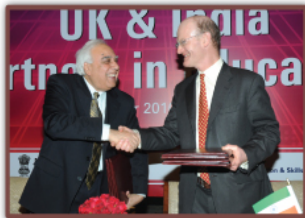
Shri Sibal and the U.K. Science Minister, Mr. David Willetts, at the MoU signing ceremony of the Deptt. of Biotechnology, in New Delhi on November 11, 2010.

The UKIERI is an ambitious programme spread over five years and it aims to improve the educational links between India and the UK.