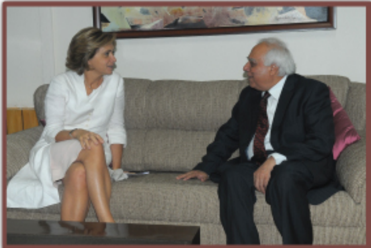
Shri Kapil Sibal meeting the French Minister of Higher Education and Research, Ms Valerie Pecresse in New Delhi on December 6, 2010.

■ ENSTA (Ecole Nationale Supérieure de Techniques Avancées),