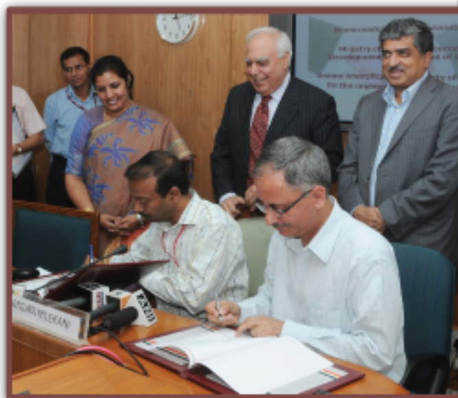
Shri Kapil Sibal and the Chairman, UIDAI, Shri Nandan Nilekani witnessing the signing of an MoU between the MHRD and the UIDAI, in New Delhi. The Minister of State for Human Resource Development, Smt. D. Purandeswari is also seen.

The MHRD would provide all support to the UIDAI in conducting proof of concept (PoC) studies, pilots to test the working of the technology & process of enrolment into the UID database, etc.