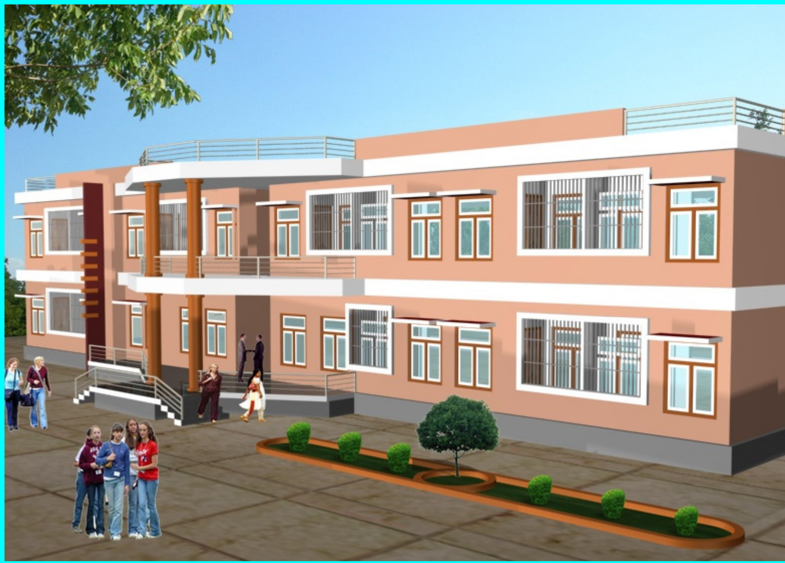
GIRLS HOSTEL, ASSAM : VIEW - III