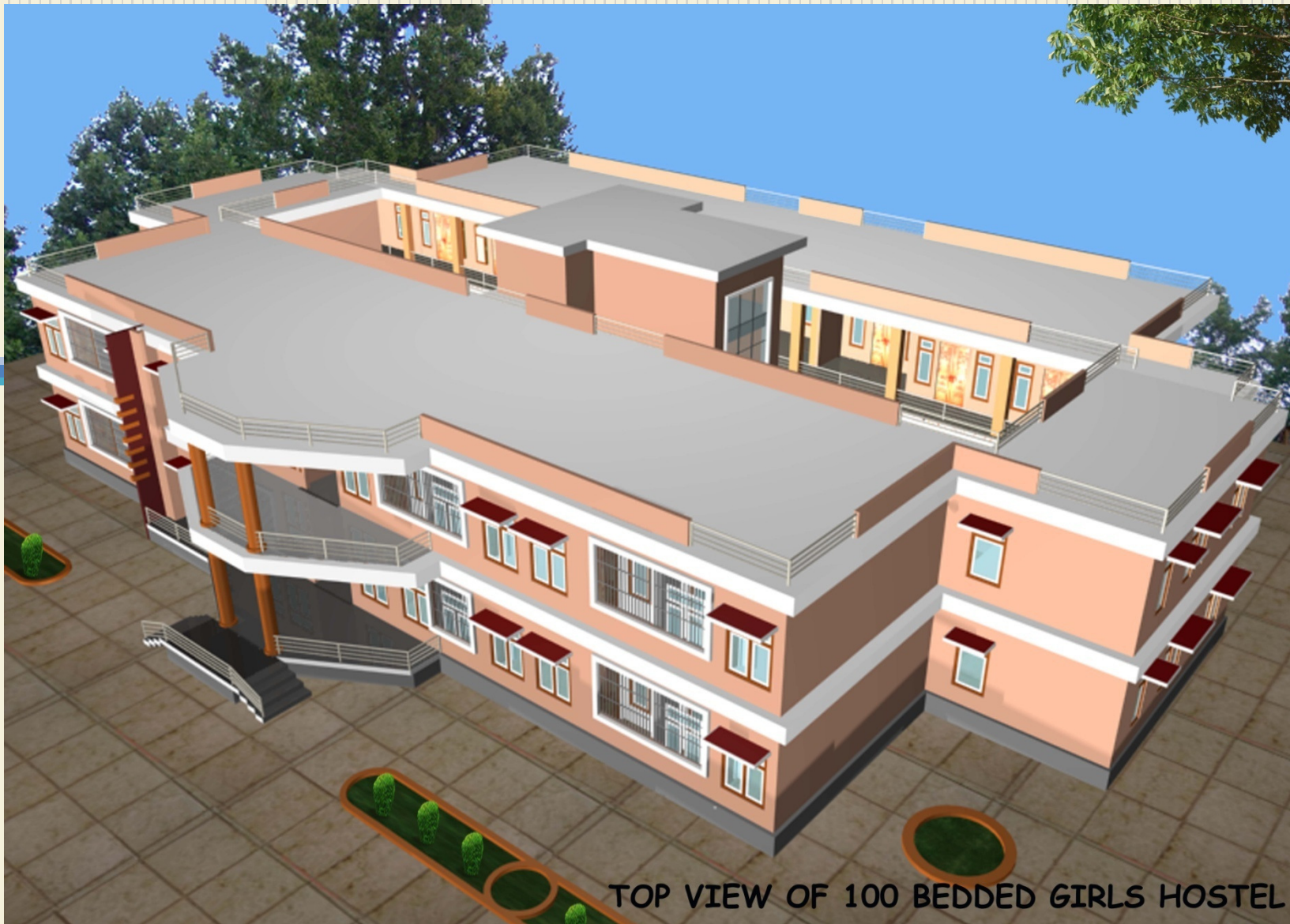
TOP VIEW OF 100 BEDDED GIRLS HOSTEL