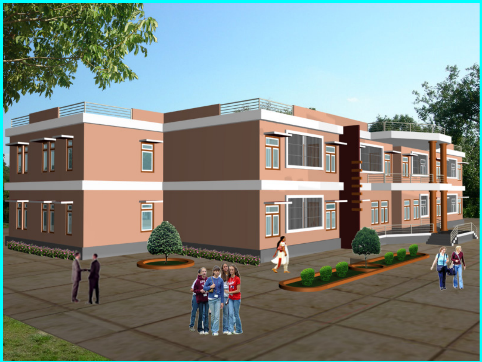
GIRLS HOSTEL, ASSAM : VIEW - II