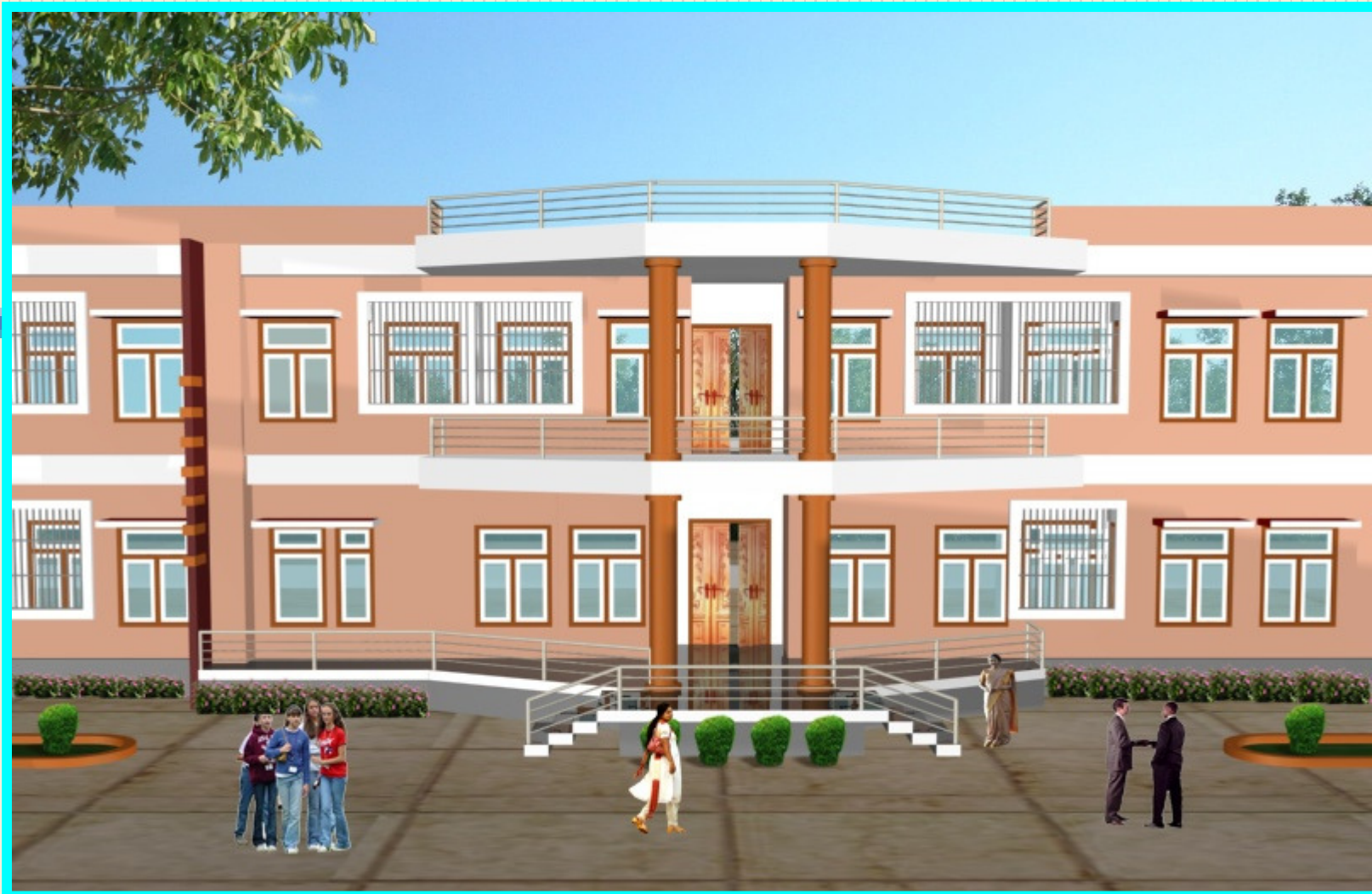
GIRLS HOSTEL, ASSAM : VIEW - I