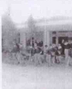
RMSA Upgraded Secondary School, Punjab