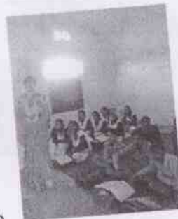
RMSA upgraded secondary school, U.P.