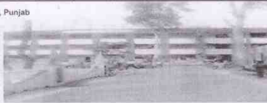
RMSA Sr. Secondary School, Punjab