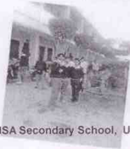
RMSA Secondary School, U.P.