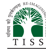
Tata Institute of Social Science